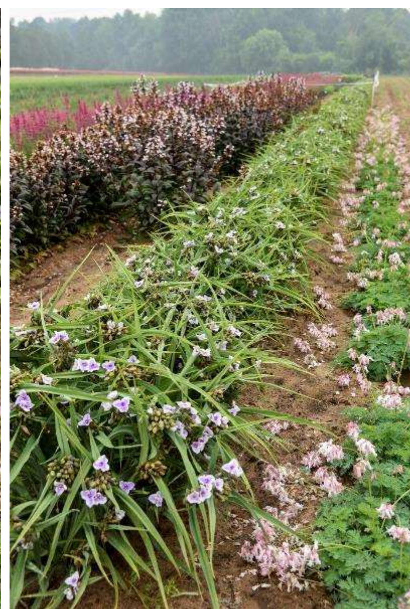
'Webmaster' field trial