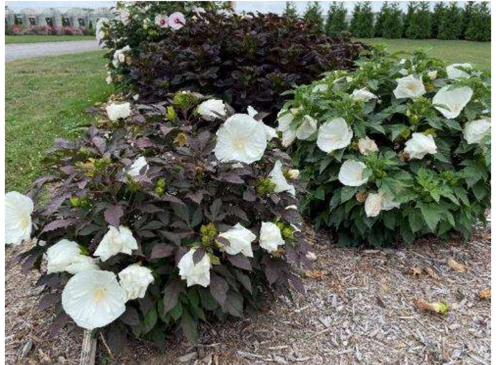
Hibiscus 'Cookies and Cream'