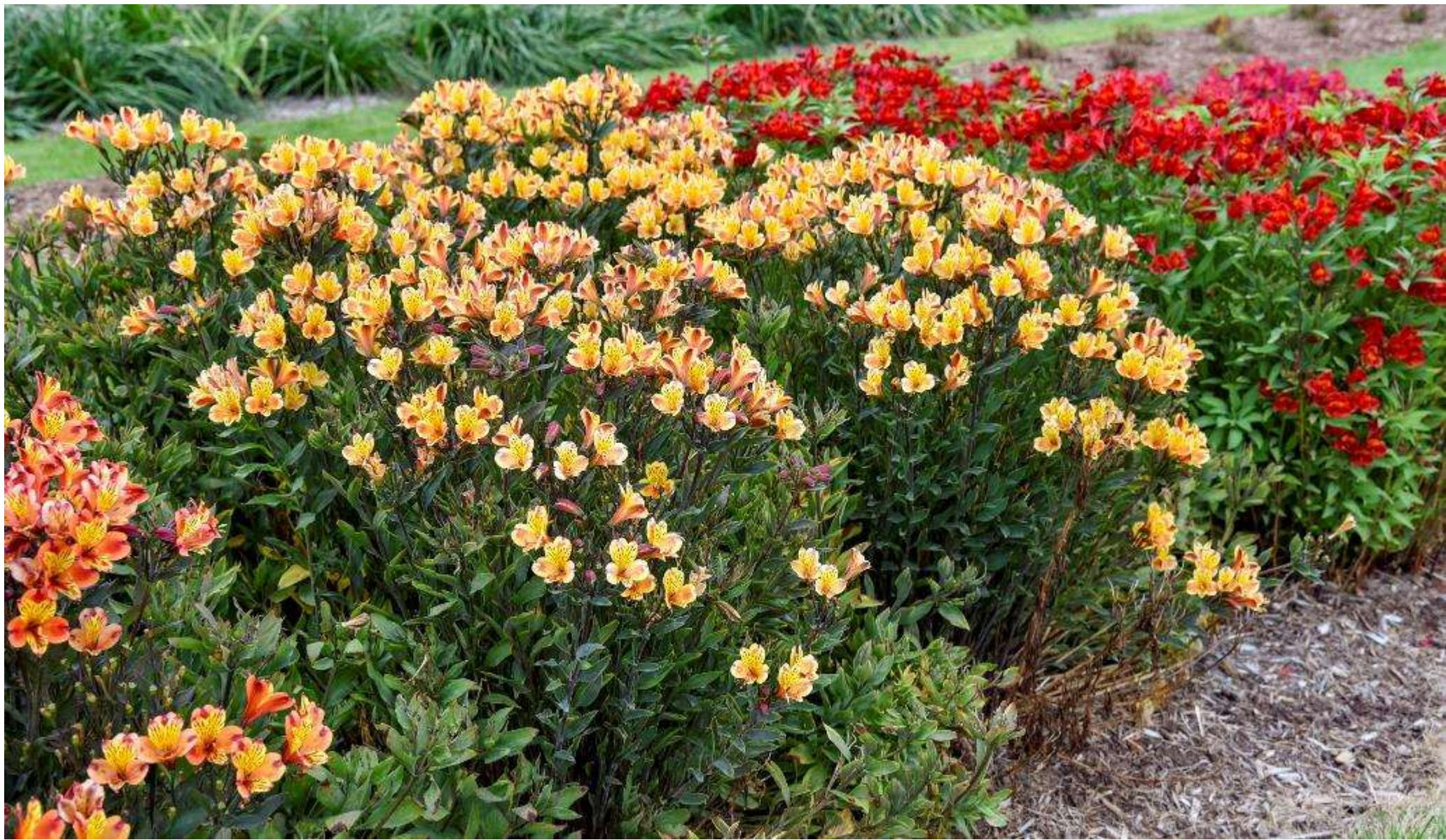
Alstroemeria Summer Breeze late season color