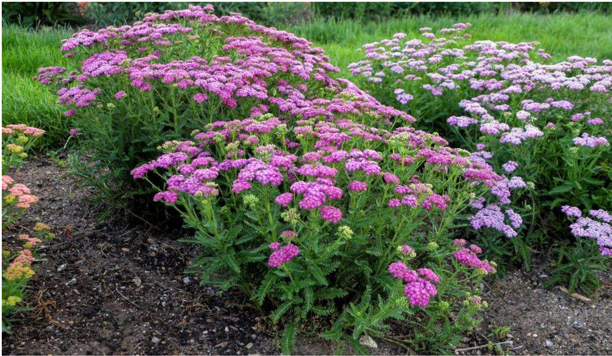
Achillea 'Firefly Fuchsia'