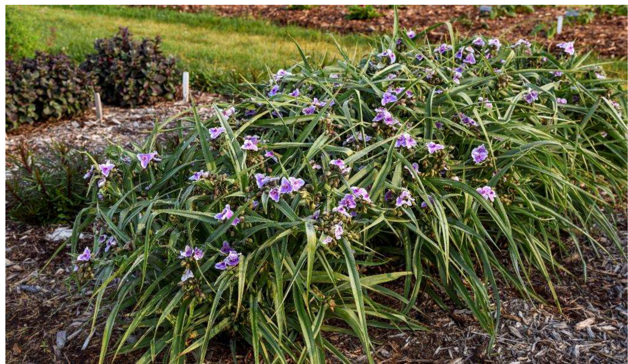
'Webmaster' foliage in late summer